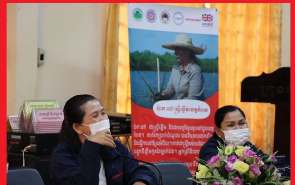
Meeting with Women Champions