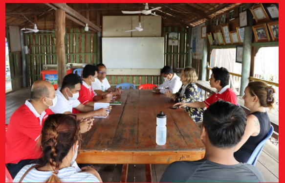
Visiting Trapaeng Sangke Community