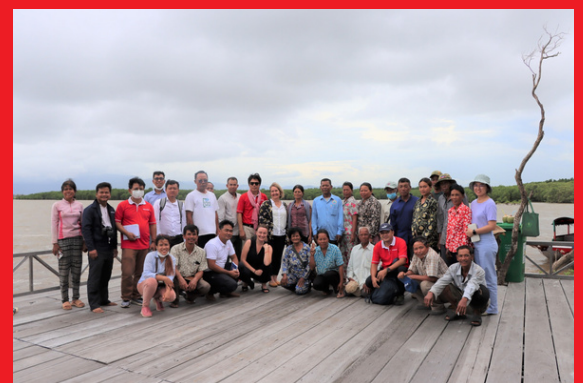
Visiting Kampong Samaki Community